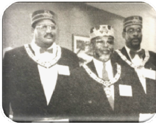
Most Excellent Grand High Priest, 1996 - 1999 Most Excellent Grand Chapter Holy Royal Arch Masons, NC