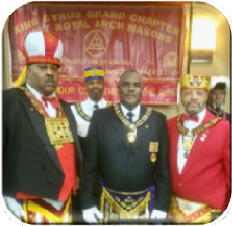
North Carolina Visit to the Virginia Grand Convocation