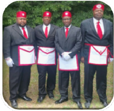
Newly Exalted Companions