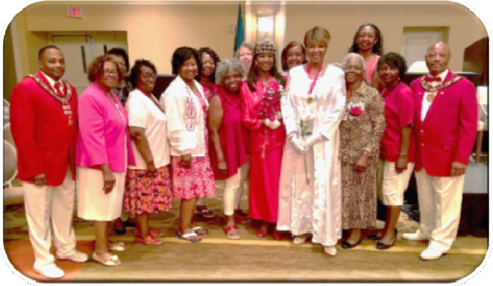
2 Companions and 13 Heroines from North Carolina during the General Conference of Grand Chapters and Courts