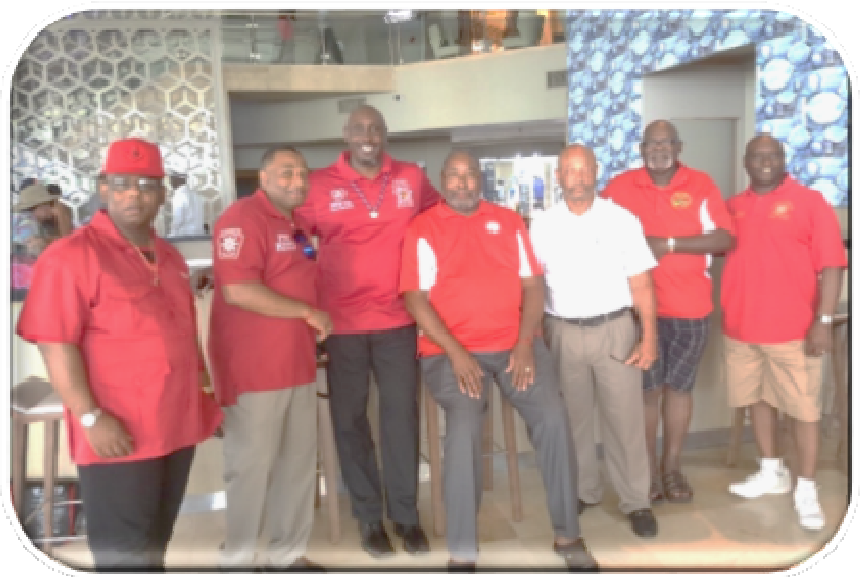
Companions fellowshipping at the General Grand Conference.