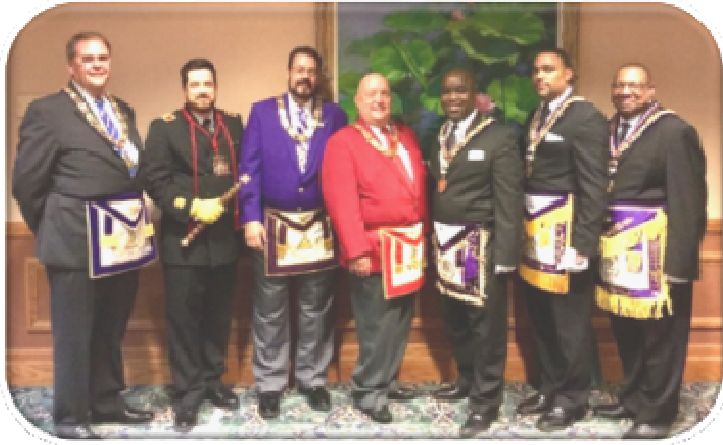
NC Prince Hall York Rite Heads of Houses with NC A.F. & A.M. York Rite Heads of Houses

Congratulations to the newly exalted Companions. The Companions of Duncan J. Whitted looks forward to work and dedication soon to come from these great men.