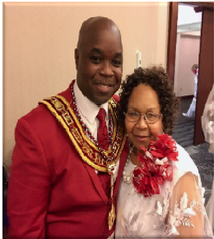
Grand Chapter, Order of the Eastern Star, NC-PHA Annual Session